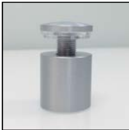
Through hole mount