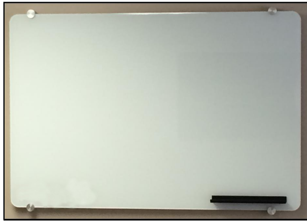
1" radius corners - edge mounts

Benefits of back painted glass marker boards: