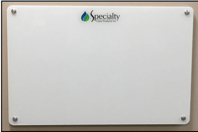
1" radius corners - through mounts